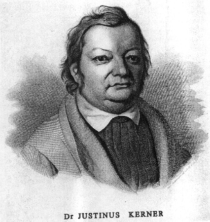
Dr JUSTINUS KERNER

Fig. 1. Dr. Justinus Christian Kerner was an accomplished romantic poet and official physician in South Germany. Because of his notes, botulism was known as Kerner's disease in those days.