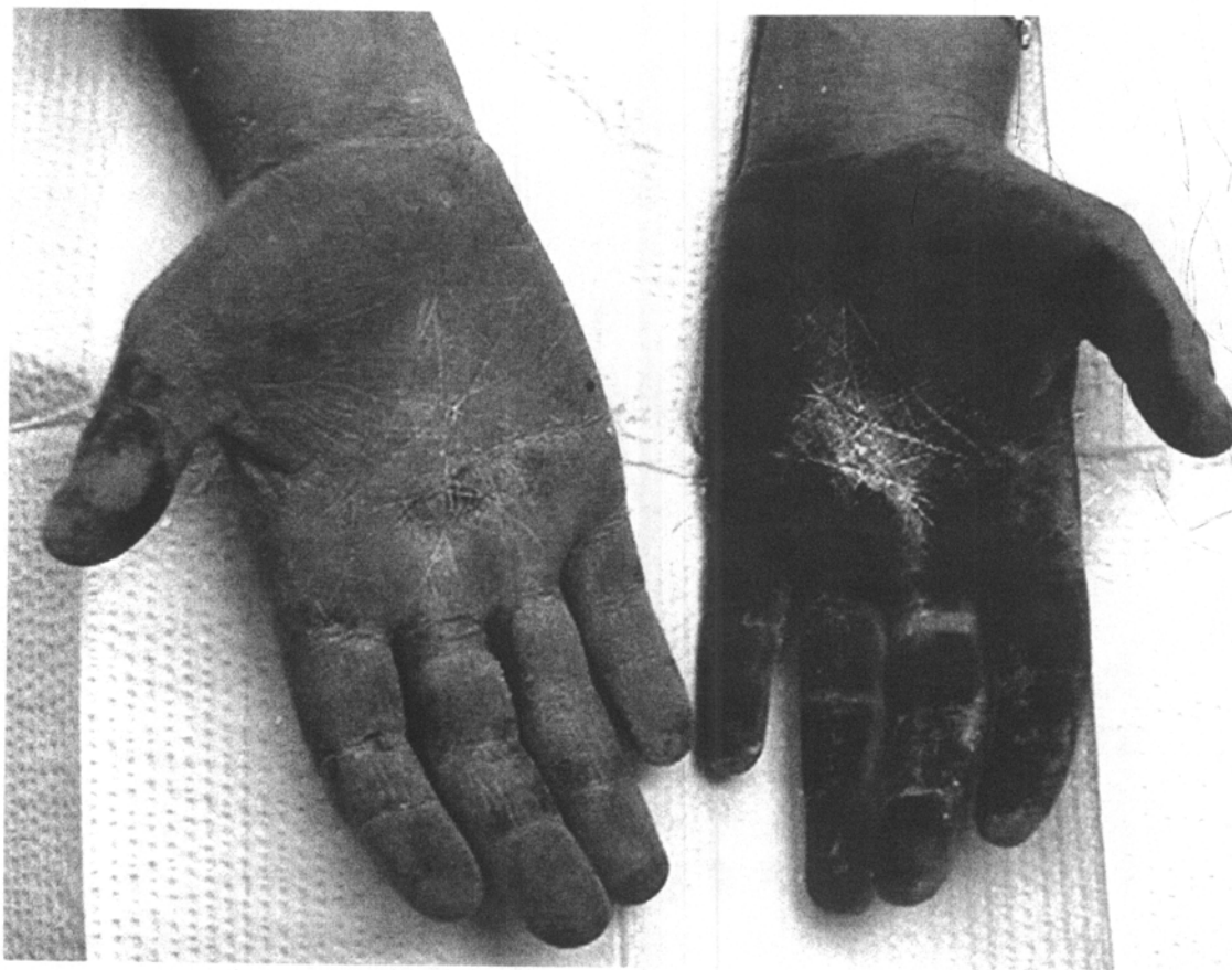
Fig 4. Minor starch-iodine test. Right hand treated 2 weeks previously. Left hand untreated.

U per palm, whereas a woman with a size 6 shoe (United States) may require as little as 75 U to cover the palm. The average dose in our patients was about 120 U per palm.