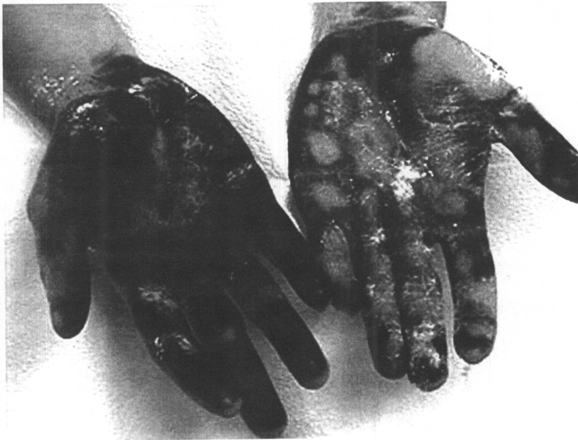
Fig 1. Minor starch-iodine test. Right hand untreated. Left hand 2 days after treatment with Botox. Note areas of diffusion with anhidrosis developing circumferentially around injection sites.

sufficient anesthesia. The disadvantage of using wrist blocks is that the patients reactive hyperemia that develops increases the tendency to bleed from each small injection site, which may increase loss of material from the injection site and decrease the relative effectiveness of each injection. Warning patients off aspirin prior to treatment is probably wise for the same reason.