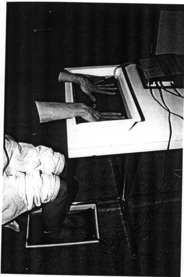
Fig. 3. In the treatment of palmoplantar hyperhidrosis, TWI is conducted simultaneously, with hands and feet in separate pans.

documented, is noninvasive and is usually granted cover by the health insurance (home treatment device). In palmoplantar hyperhidrosis, TWI is conducted simultaneously, holding hands and feet into separate pans (fig. 3), applying the same treatment scheme as for hands or feet alone.